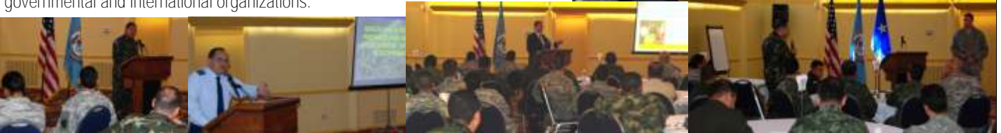
Scenes from the symposium with presenters from U.S. and Partner-Nations. (Upper right) Symposium attendees pose with Institute leaders 'for the record.'